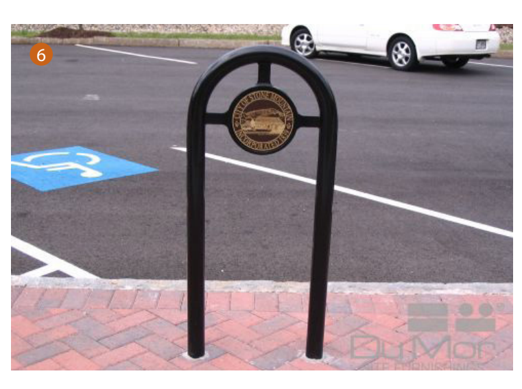
* = Or approved equivalent