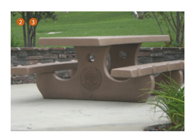
* = Or approved equivalent