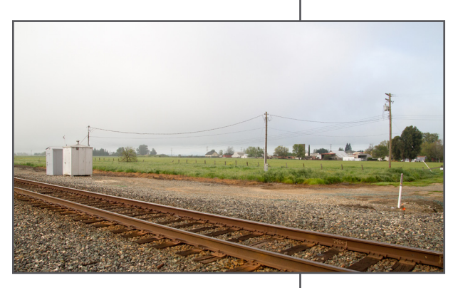
Railroad Tracks near Elk Grove

resources that could advance the services and infrastructure.