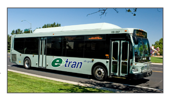
City e-Tran Bus

Policy MOB-5-7: Provide the appropriate level of transit service in all areas of Elk Grove, through fixed-route service in urban areas, and complementary demand response service in rural areas, so that transit-dependent residents are not cut off from community services, events, and activities.