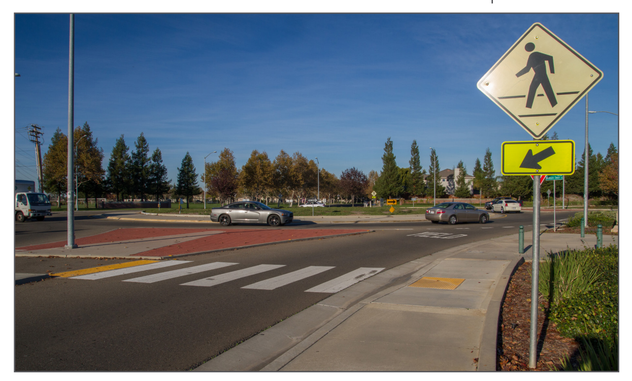
Traffic Circle in East Elk Grove

(ii) Roadway Performance – Generally, and except as otherwise determined by the approving authority or as provided in this General Plan, the City will seek to achieve, to the extent feasible and desired, the average daily traffic design targets identified in Table 6-4.