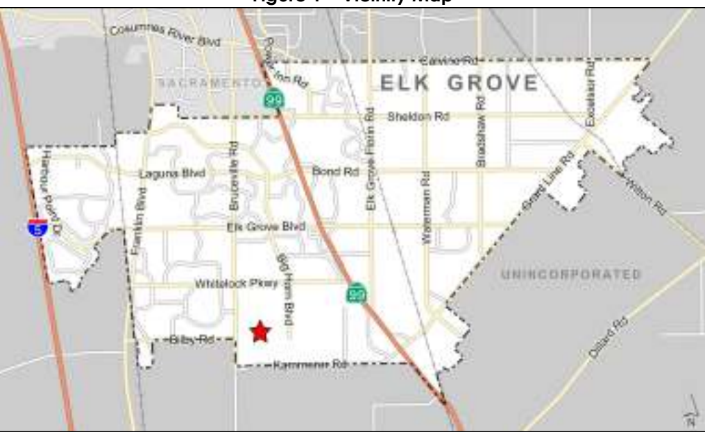
Figure 1 – Vicinity Map