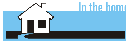
In the home

Following some simple safety tips can lead to a happier holiday season for everyone. Preventing house fires, vehicle theft and auto accidents can be as easy as remembering the rules during the hustle and bustle of the holidays and winter vacations.