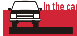
In the car