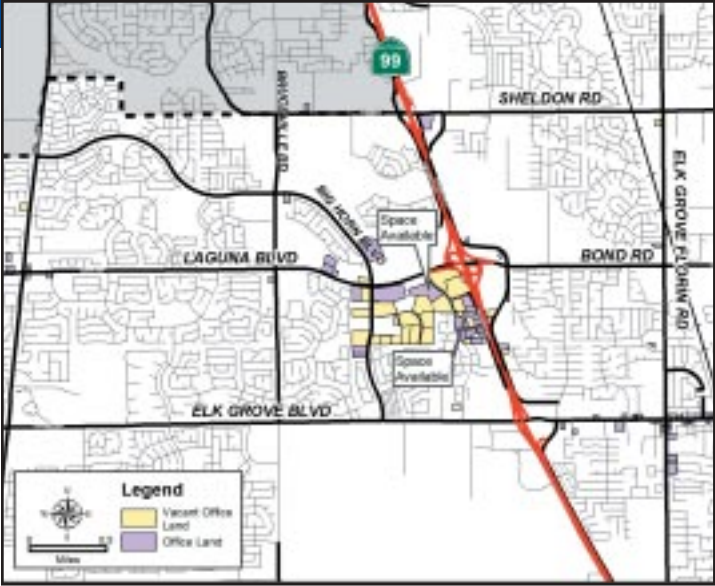
Elk Grove Office Space