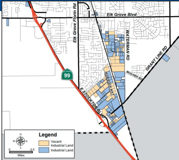
Elk Grove Office Space