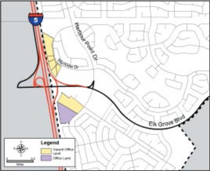
Laguna West Office Space

The City of Elk Grove is poised to take its place as an important hub of office development. Over one quarter of a million square feet of new office space has been developed in the City since incorporation, most of which was centered in the Laguna Gateway area at the southwest and northwest corners of Highway 99 and Laguna Boulevard. Recent office projects have included the following: Office Park Circle (39,160 square feet), 9280 West Stockton Boulevard (51,760 square feet), the Kaiser Medical Office Building on Big Horn Boulevard (102,000 square feet), and the first phase of the Laguna Springs Corporate Center (59,299 square feet). Numerous smaller office projects have also developed along Elk Grove Boulevard to serve the needs of smaller businesses.