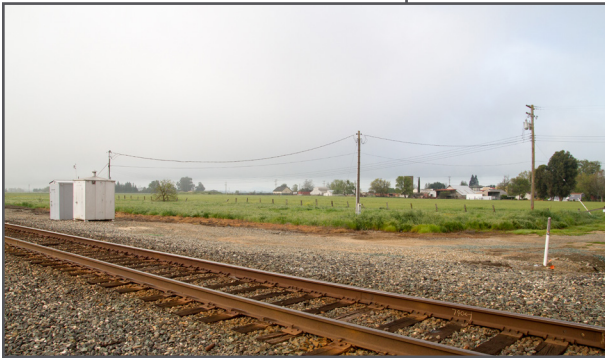
Railroad Tracks near Elk Grove

The City views light rail (or other high-frequency transit, such as bus rapid transit) as an important part of the overall transit plan for Elk Grove, including the use of light rail to connect workers to current and future employment centers in the City. The planned route for light rail service is illustrated on the Transportation Network Diagram in Chapter 3. However, current funding constraints must be addressed to advance planning and construction efforts. The City will work closely with SacRT, SACOG, and other jurisdictions in the region to identify funding strategies and other resources that could advance the services and infrastructure.