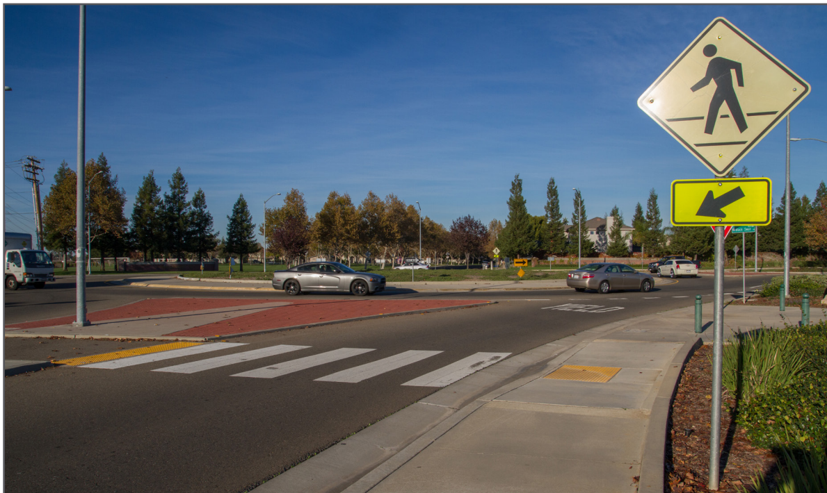
Traffic Circle in East Elk Grove