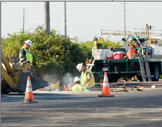
Roadway Construction in Elk Grove

Standard MOB-7-1.a: Generally, new roadway construction or road widening shall be completed to the ultimate width as provided in this General Plan and shall also provide required bicycle and pedestrian improvements and paths. However, phased improvements may be allowed based upon the timing of development and facility demand as determined by the City Engineer or as otherwise provided in this General Plan or an applicable specific plan or other area plan. Regardless, all roadways, pedestrian facilities, and bike routes or bikeways shall be constructed in logical and complete segments, connected from intersection to intersection, to provide safe and adequate access.