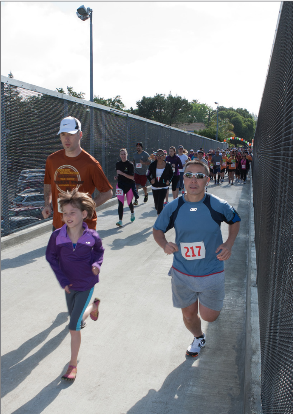
Pedestrian Bridge over SR-99

Finally, the Supporting Principle affirms that the City will have roadways in place that allow efficient movement and safe travel spaces for all modes of getting around. Proper maintenance and minimum thresholds for roadway capacity remain core components of Elk Grove’s approach to mobility; thus, this chapter includes roadway performance targets (RPT) to address these issues.