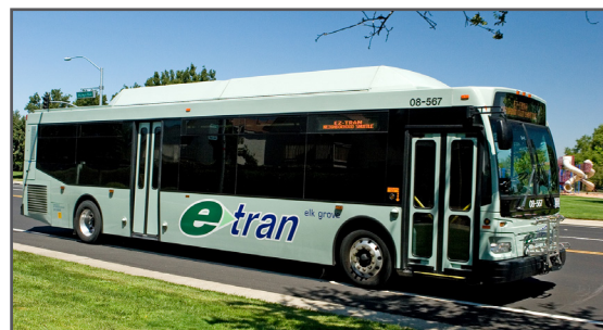
City e-Tran Bus