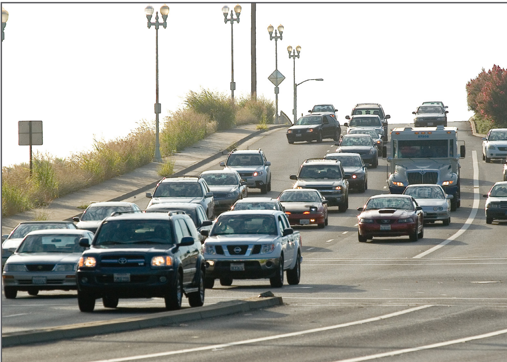
Traffic in Elk Grove