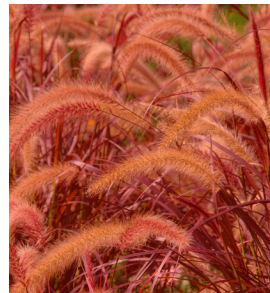
Pennisetum spp. Fountain Grass