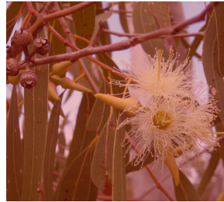
Eucalyptus spp. Eucalyptus

Privately owned and maintained properties may utilize some plant material referenced on the prohibited plant list.