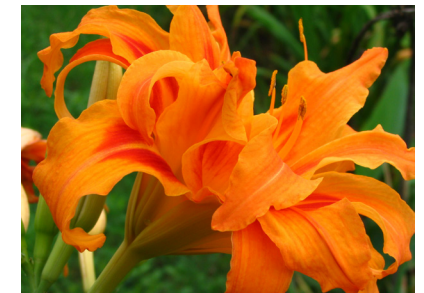
Hemerocallis sp. Evergreen Daylily