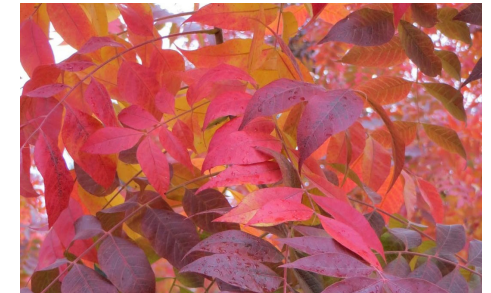
Pistacia chinensis 'Keith Davey' Chinese Pistache