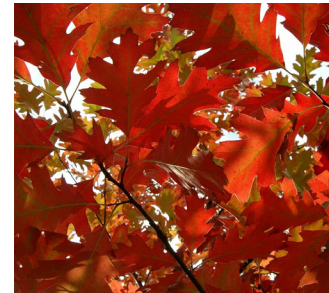
Quercus rubra Red Oak