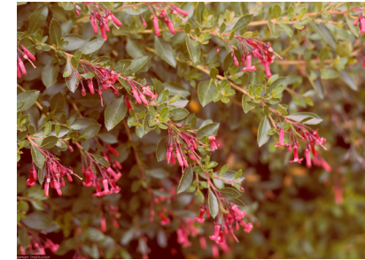
Escallonia spp. Escallonia