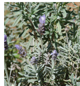
Lavandula dentata French Lavender