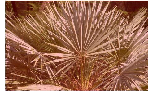
Chamaerops spp. Palm