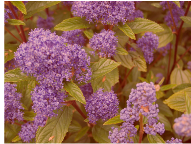
Ceanothus spp. Ceanothus