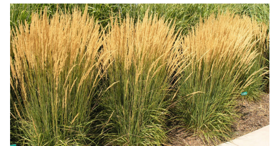
Calamagrostis acutiflora 'Karl Foerster' Feather Reed Grass